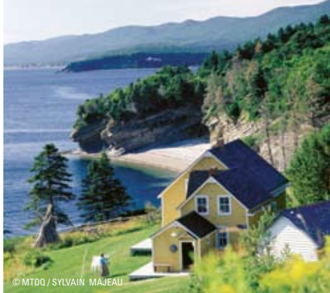
CANADIAN TOURISM COMMISSION